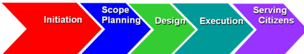
Figure 1. IOWAccess Project Lifecycle

Phase 1 - Initiation - This requires the investment of a small amount of resources, resulting in a reliable estimate of the cost of gathering and documenting detailed requirements. The deliverables